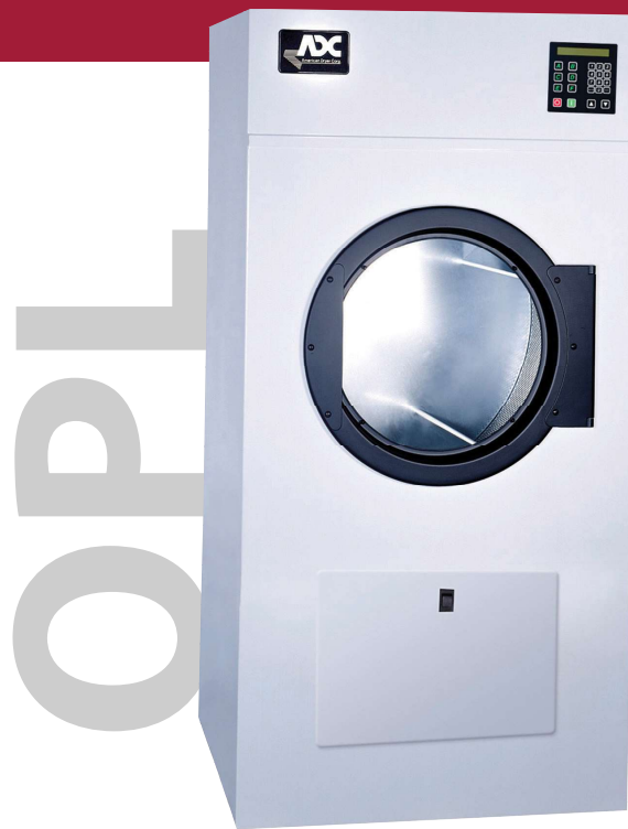
AD-30V OPL Dryer