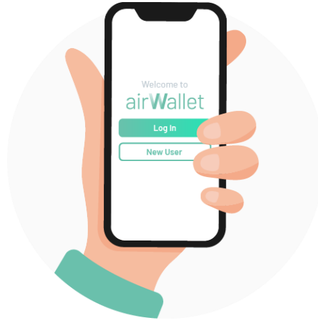
Login or Create User