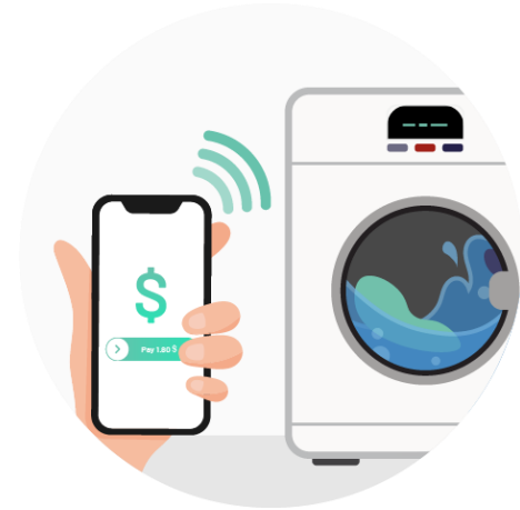
Pay for the desired wash