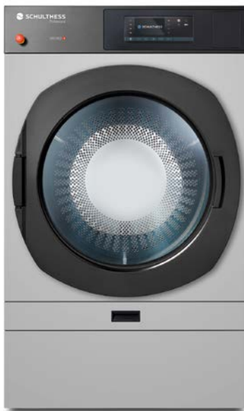
Model Grey matt