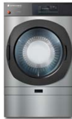
Model Chrome steel