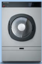
proLine D490 Stone 4256.1