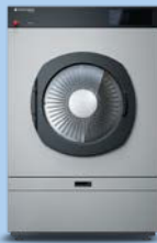
proLine D650 Stone 4257.1