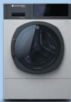
starLine prime Stone AEA1.109