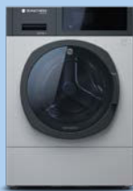
starLine Stone AEA0.109