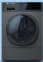
starLine prime+ Carbon AEA1.110

Models – All machines are equipped with a stainless steel wash drum.